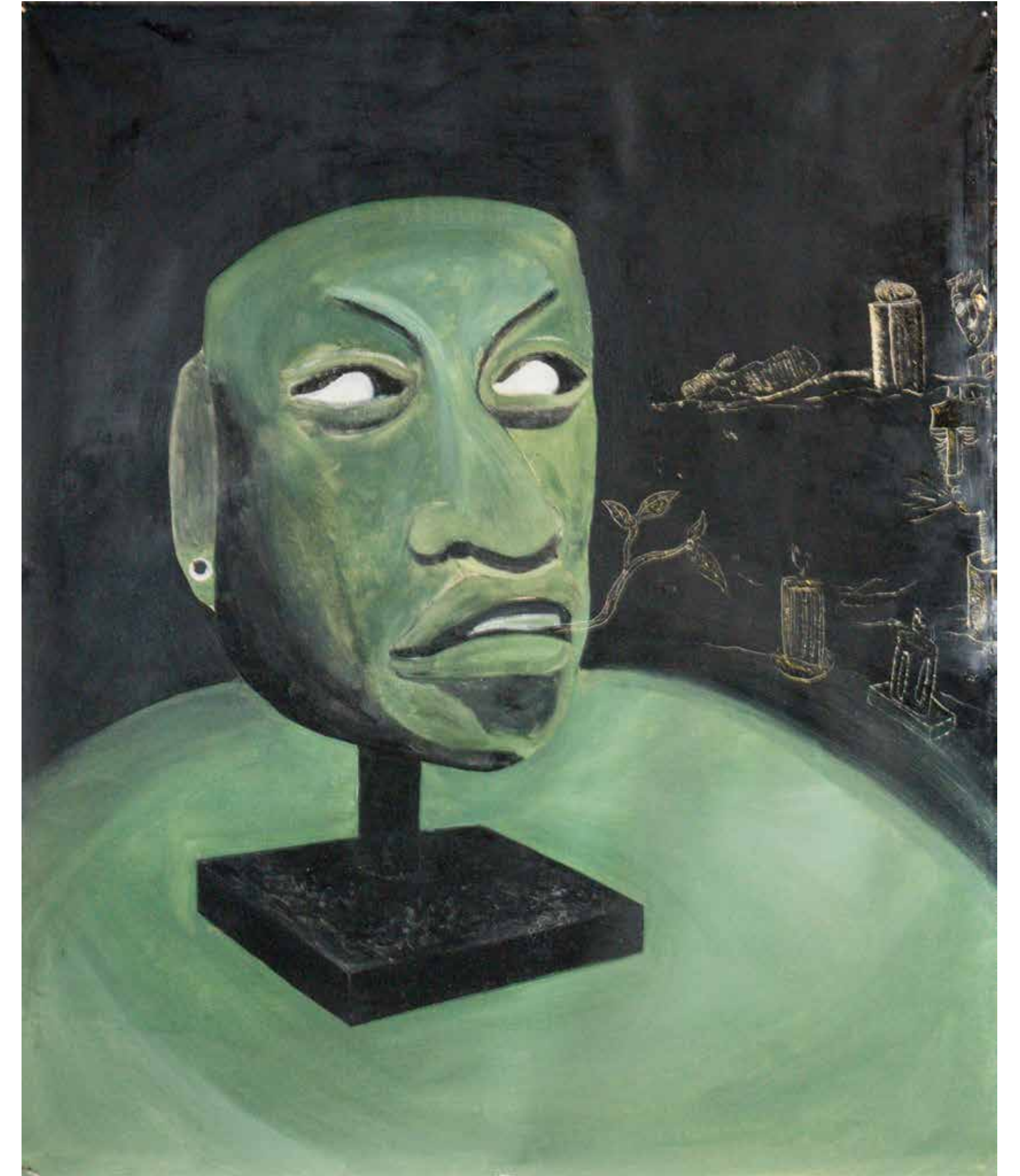
Green portrait (Sankara)

Oils and glitter on linen 850 x 750 mm 2022