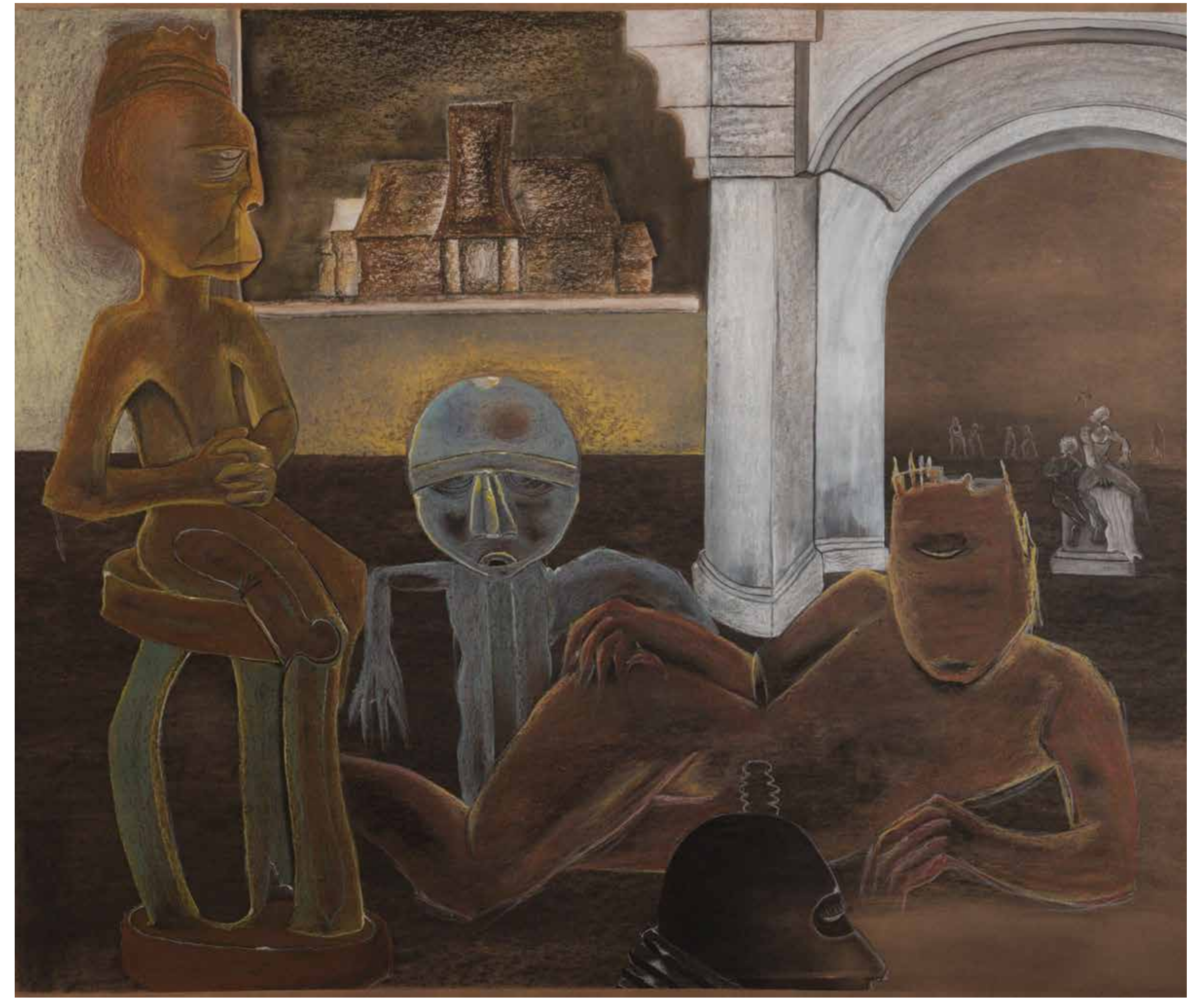
Sekolo sa kwa Benin (School of Benin)

Pastel and glitter on brown paper 1250 x 1670 mm 2022