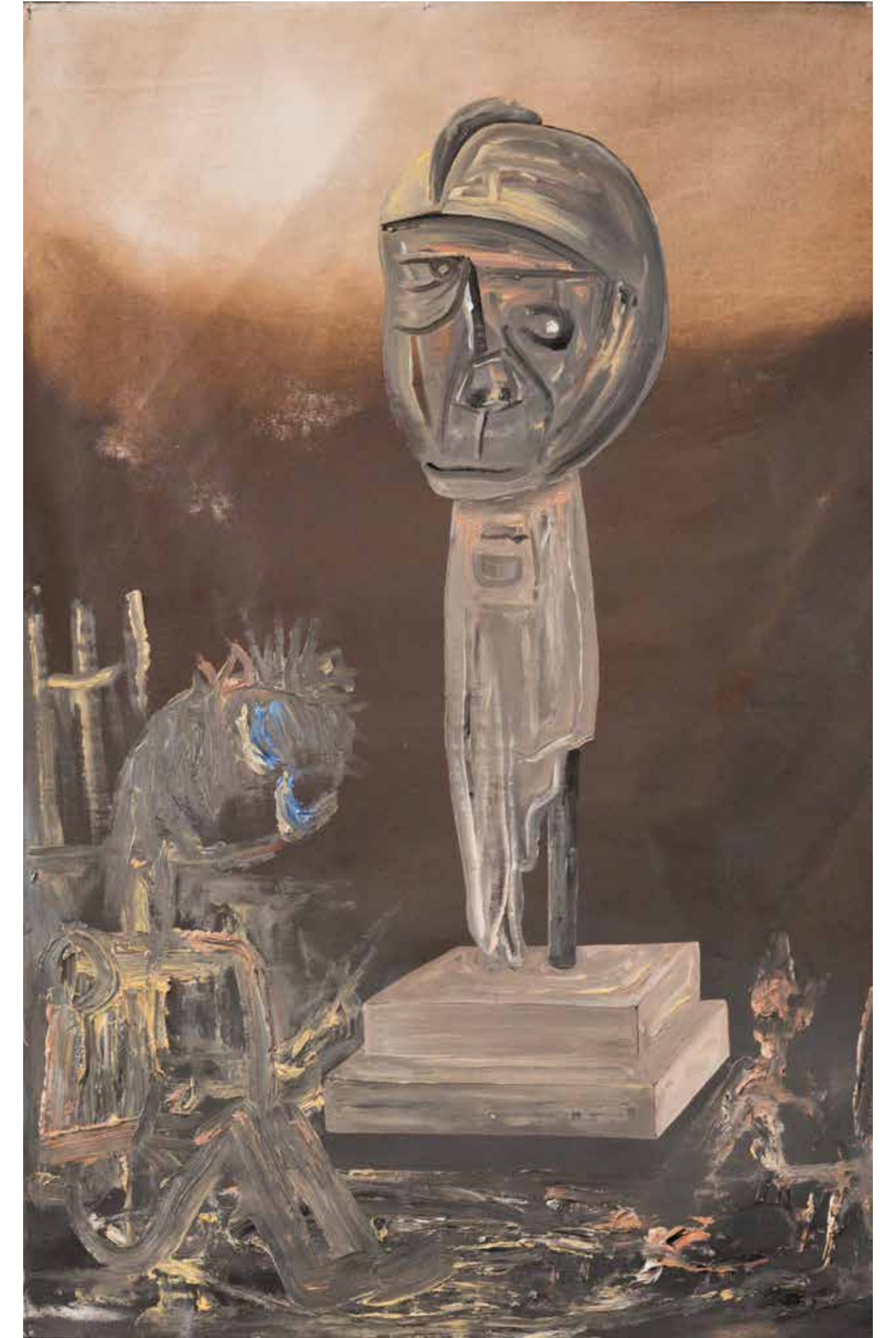
Adoration of the Oba

Oils and glitter on cotton 1100 x 710, 5 mm 2022