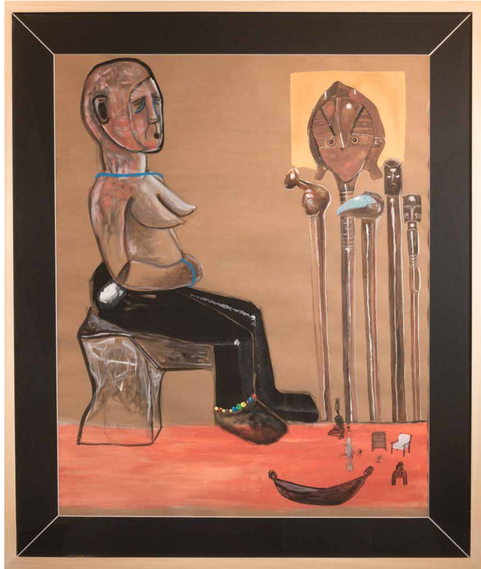
Thero kwa Igodomigodo (sermon at Igodomigodo)

Gouache on brown paper 1270 x 1130 mm 2022