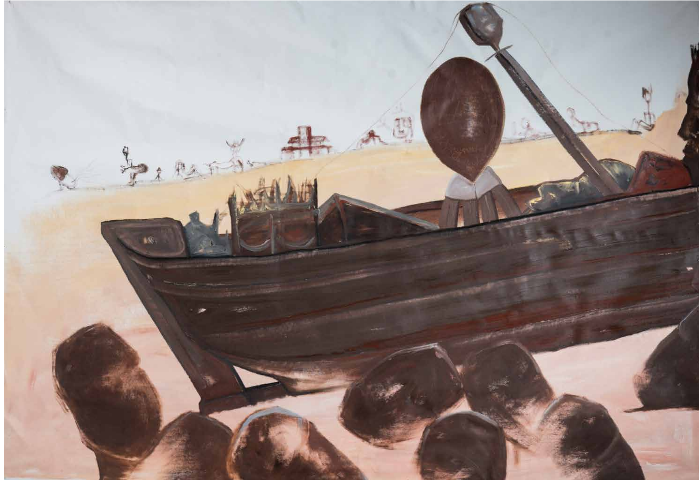
Petelelo ya Benin (the Rape of Benin)

Oils and glitter on cotton 1090,5 x 1580 mm 2022