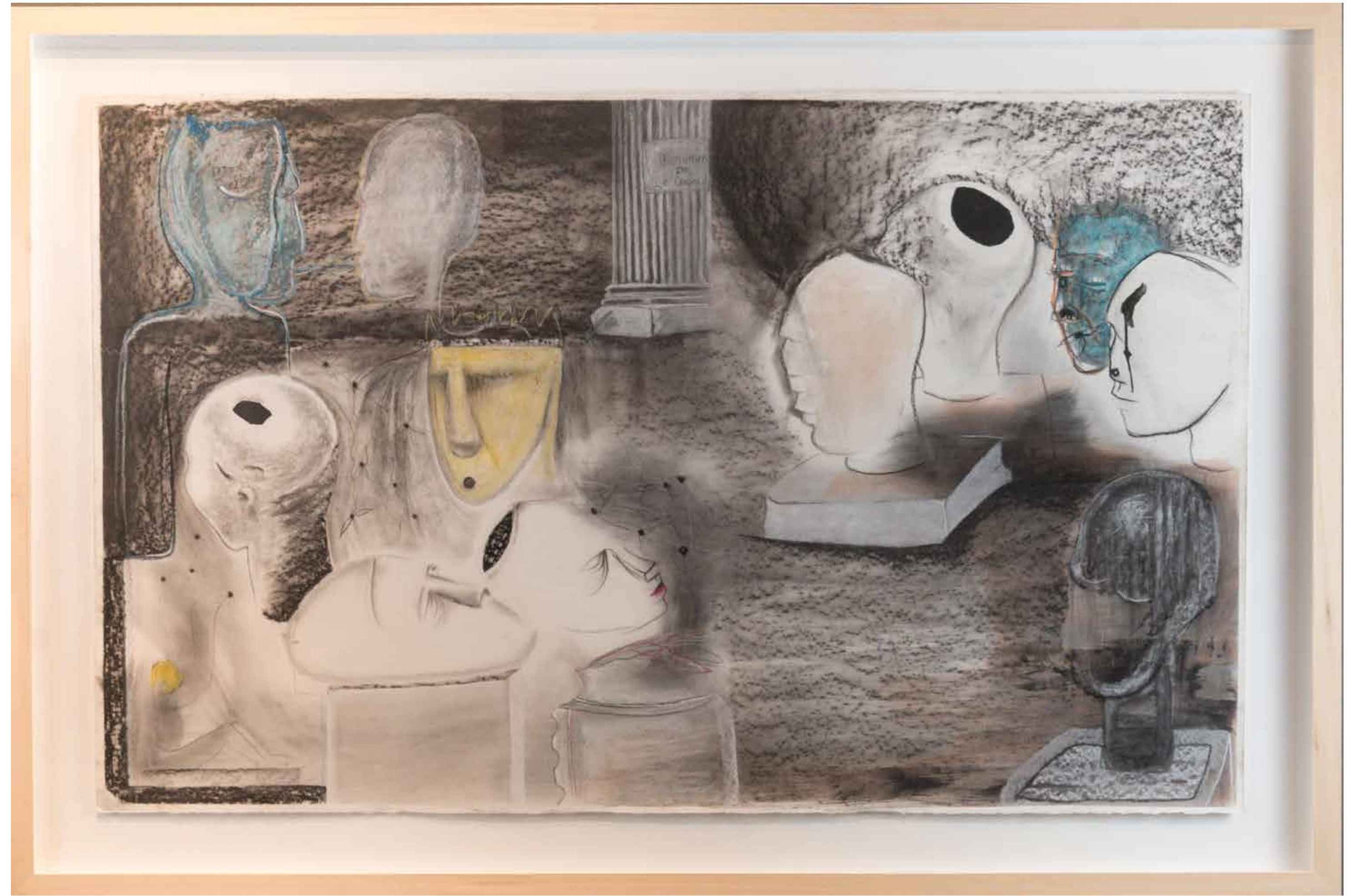
Drawing in defense of the Confused

Pastel and glitter on arches 1250 x 1840 mm 2022