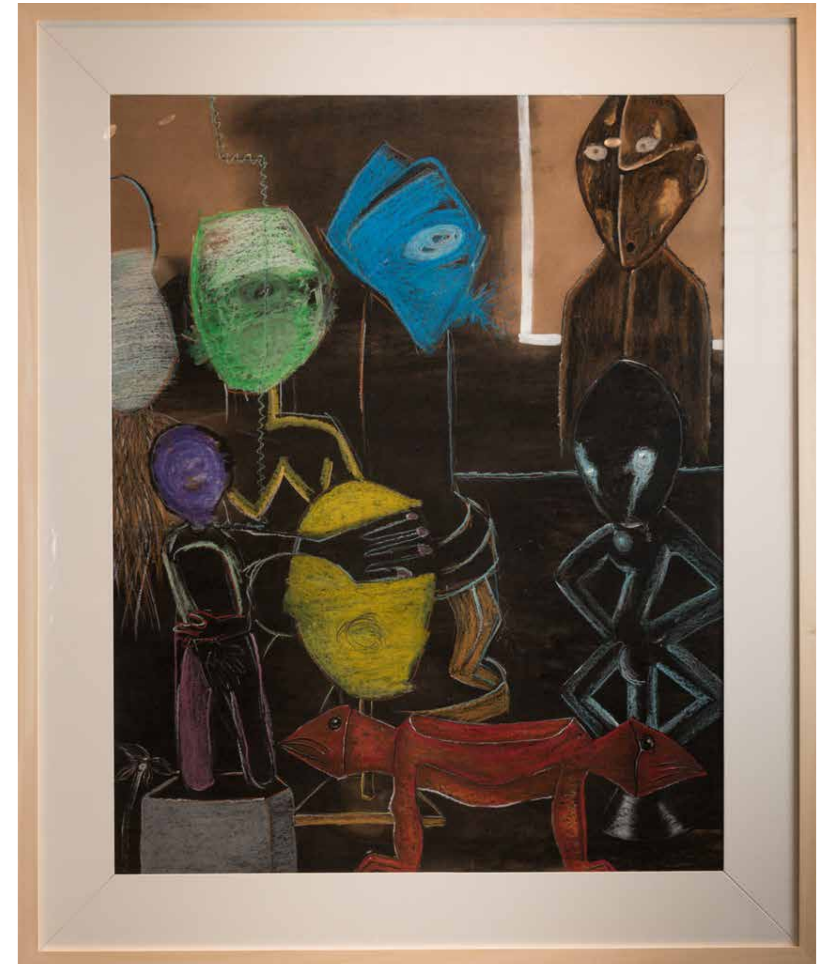
The Benin tableau (for Charles Nkosi)