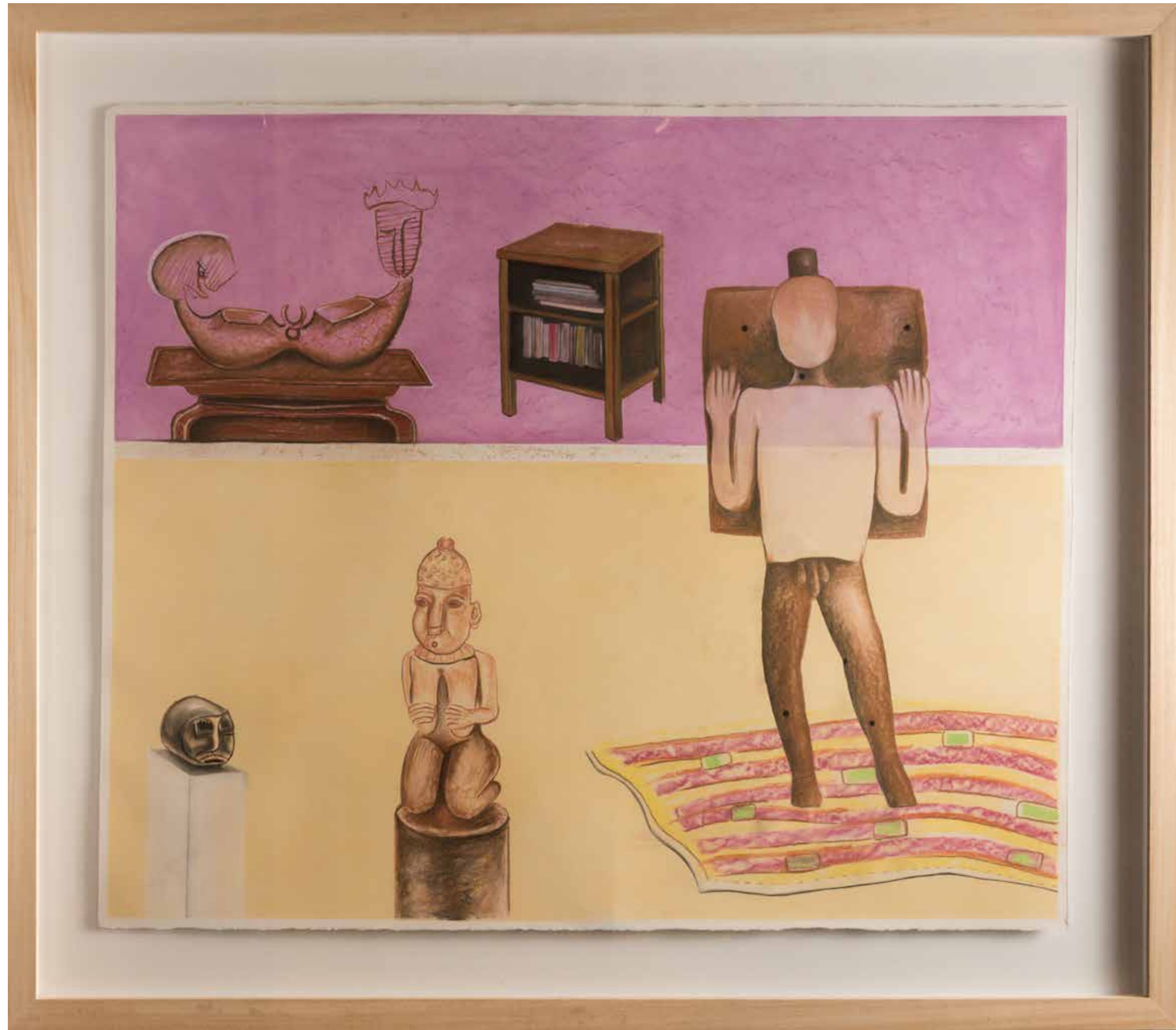
View of the Governor's interior with power figures, head and other things

Pastel and glitter on arches 1150 x 1340 mm 2022