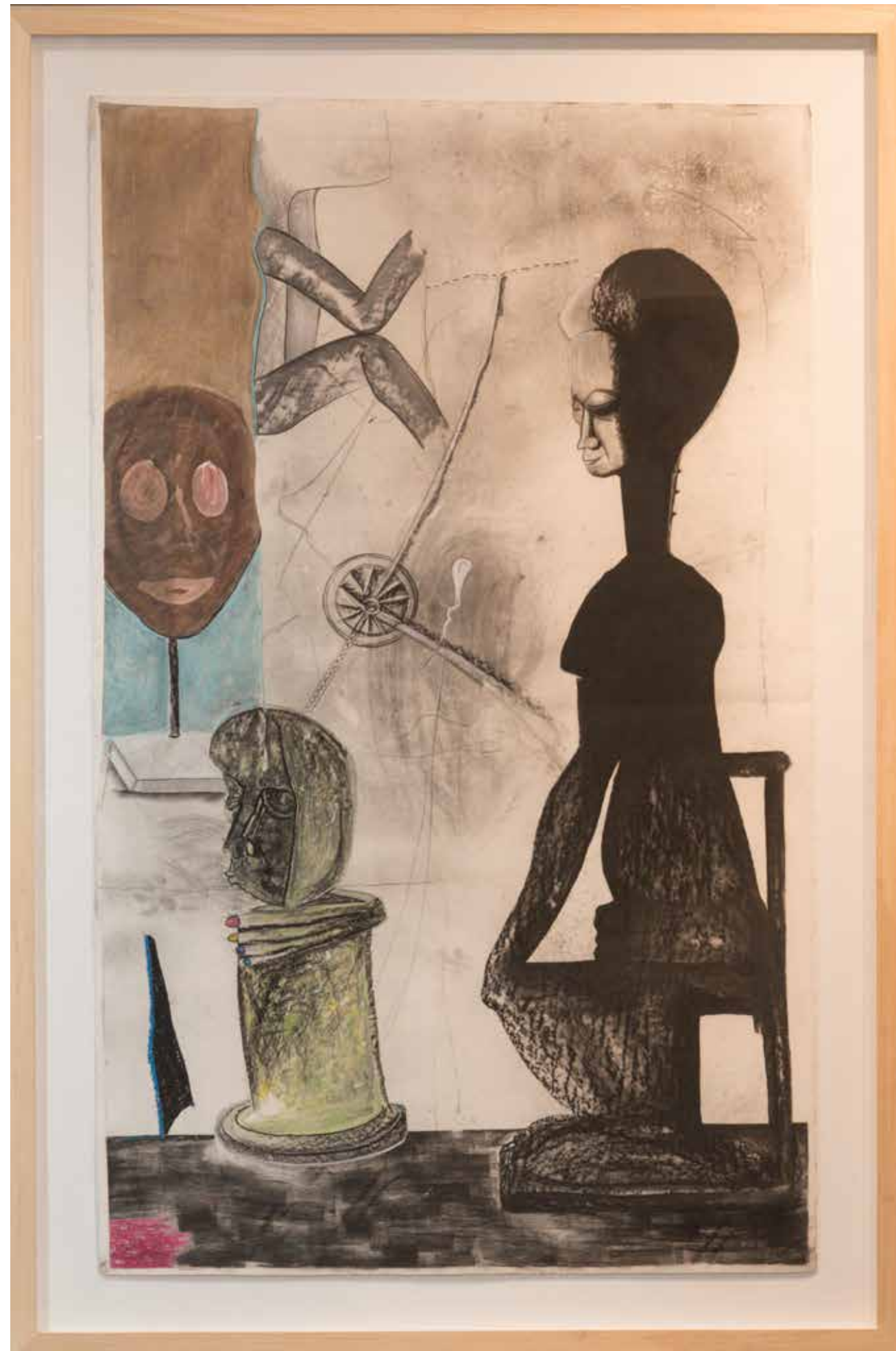
Drawing in defense of the Confused

Pastel, oils and glitter on arches 1900 x 1140 mm 2022